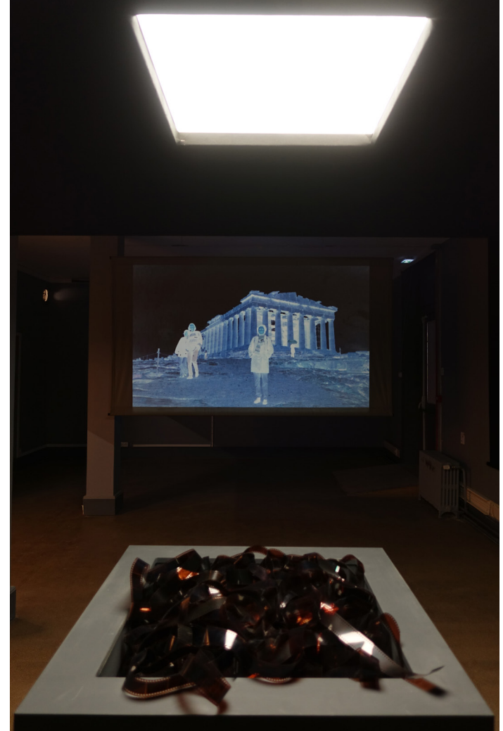
Negative room A pile of 5 kg of 35 mm negatives for visitors to interact with, facing a slideshow of 160 inverted images.